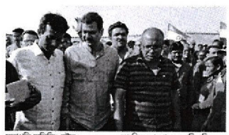
সম্পর্কিত অধিবেশন... স্থানীয়দের কাজের দাবিতে আধিকারিকদের সঙ্গে বৈঠক তৃণমূল শ্রমিক সংগঠনের...